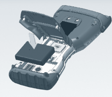
Insert the battery pack(s) so battery contacts match up.