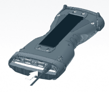
Plug battery charger into wall outlet, then into the unit.