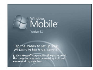
Follow on-screen instructions to set up device.