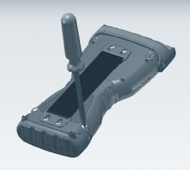
Use edge of a key or screwdriver to open battery compartment.*