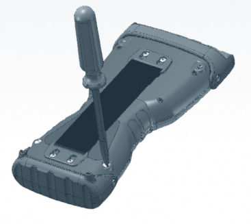
Re-attach battery door.